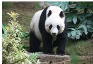
Giant panda bear