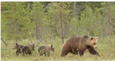
Brown bear cubs with their mother in a forest in Sweden

Only mother bears stay with their young cubs until they are at least a year old.