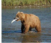
The rest of the bears eat leaves, roots, berries, insects, old meat, fresh meat and fish. This brown bear is eating salmon

In the spring bears find berries in bushes or at the tops of trees.