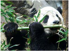
Giant pandas mostly eat bamboo

Bears have an excellent sense of smell which helps them find food.