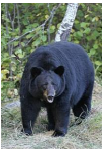
American black bear