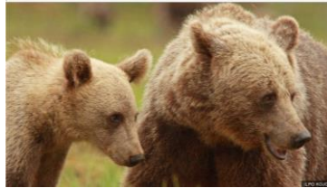
A female Scandinavian brown bear with her cub

Some bears like to be out and about during the day others like to be out at night.