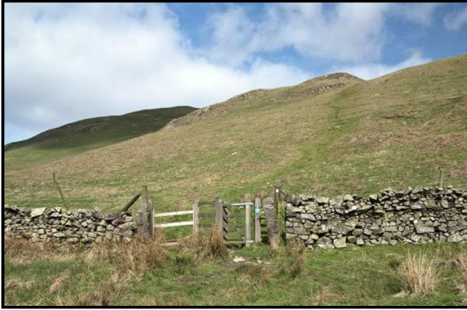
The steep ascent of Dufton Pike starts at the kissing gate

Rising easily, this open bridleway once served to connect the village with the intensive lead mining activity of upper Great Rundale. Seek a kissing gate in the wall on the left. This gives access to the direct ascent of Dufton Pike, climbing the steep slope with evidence of rabbit burrows on a popular grass trail up the south ridge.