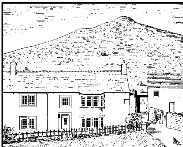
Duften Pike from the village green

Your rights on open access land can sometimes be restricted for nature conservation, land management or public safety reasons. To avoid disappointment, please visit www.countrysideaccess.gov.uk to get the latest information, before you set out.