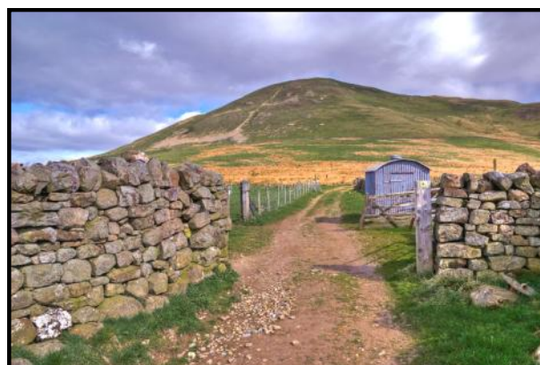
Duften Pike from the shepherd's cot

Keep within the confined lane rising by the sympathetically restored Pusgill House. Beyond this cottage, the lane becomes more the age-old green-way emerging into pasture at a gate and corrugated shepherd's cot.