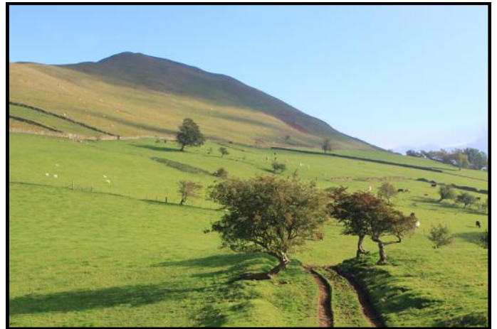
Dufton Pike from the track leading to Halsteads

At the top of the rise the track swings left flanked by the remnants of an old hedged lane leading down through cattle pasture to a gate entering a lane beside the remote former farm of Halsteads, the yard still used for stock handling.