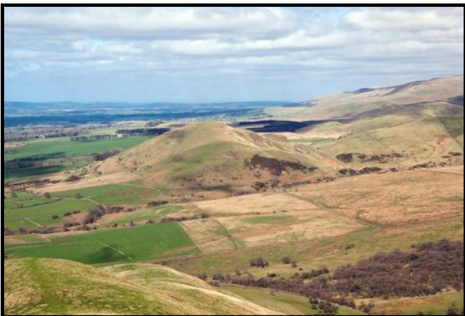
Knock Pike from the north ridge of Dufton Pike

Looking eastwards are Brownber Hill, the limestone scars of Great Rundale and the whole amazing Pennine scarp, which has a propensity to attract cloud. Westwards the huge expanse of the Eden valley stretches attention towards the distant High Street range. Appleby lies to the south and perhaps with the occasion thump, thump you may be made aware of the Warcop military firing ranges to the south-east.