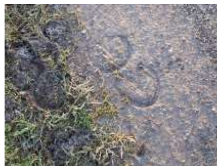
Usage by Horse