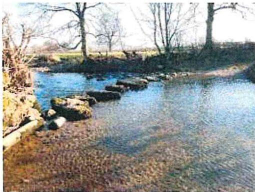
Stepping stones and shallow ford at Wain Wath, where the continuation of Waltnber Lane crosses Scanda Beck