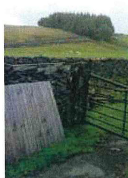
View E from Longdale Farm