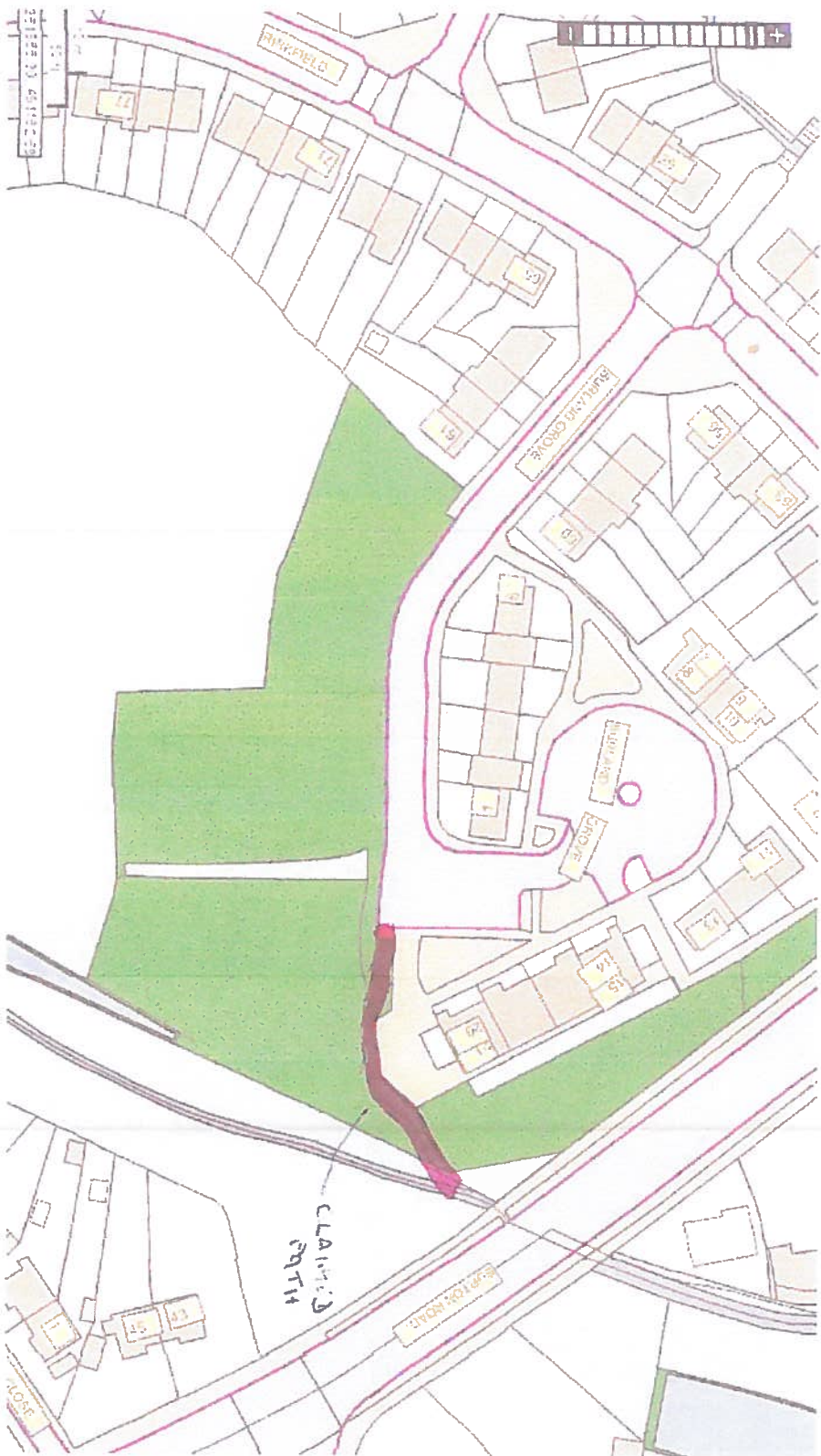
Burland Grove Footpath Link to 352060.491166 to 352100.491176 Public Right of Way FP536047 on disused canal towpath