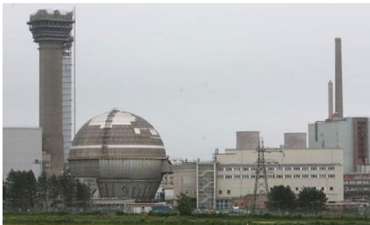
Windscale Pile 1 and Advanced Gas-cooled Reactor

15. The Plan/RWI indicates that as of 1 April 2013 the reported volume of UK ILW was 95,600m 3 of which about 69,600m 3 (73%) was stored at Sellafield. How much of the UK's total ILW is generated at Sellafield as opposed to being stored there? How much is imported from elsewhere both within Cumbria, such as the Low Level Waste Repository (LLWR), and from outside?