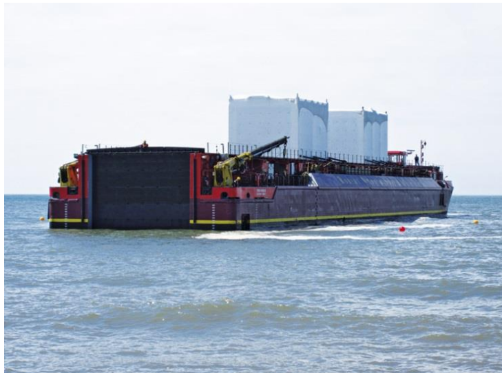
Shipping of new Evaporator (D) modules for HALES plant

As set out in the response to Q4, HAL will be stored in the HASTs until they are due to be emptied to a POCO heel. POCO and tank emptying is a sequential process with no more than two tanks in POCO at any one time, and two tanks held to feed the Waste Vitrification Plant (WVP). HAST POCO is due to start circa 2020, following the cessation of reprocessing. HASTs and the WVP will support liquor management from the reprocessing plants whilst undergoing Highly Active Liquor Evaporation and Storage (HALES) plant POCO. HAST POCO is due to complete circa 2029/30 but this potentially could extend to 2035 or further. There are no plans for a replacement.