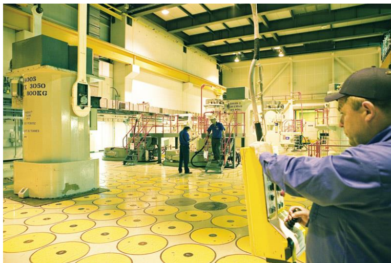
Vitrified high level waste store Sellafield

The vitrification process takes place at Sellafield in the Waste Vitrification Plant, which has been in operation since 1991. The liquid HLW is dried to a powder, mixed with silica sand and other glass-forming chemicals, then heated to a temperature of around 1,150°C (2,100°F). The molten mixture is poured into stainless steel containers and allowed to solidify into dense solid glass blocks - this solid waste volume is about a third of its original liquid volume. The canisters are then placed into the air-cooled Vitrified Product Store, until a suitable disposal route becomes available. Current practice is for the facility to store the vitrified HLW for at least 50 years before disposal; this allows much of the radioactivity to decay away and the waste to cool. The waste is then easier to transport and dispose of. When a disposal facility becomes available, each individual canister will be placed inside two further containers before disposal.