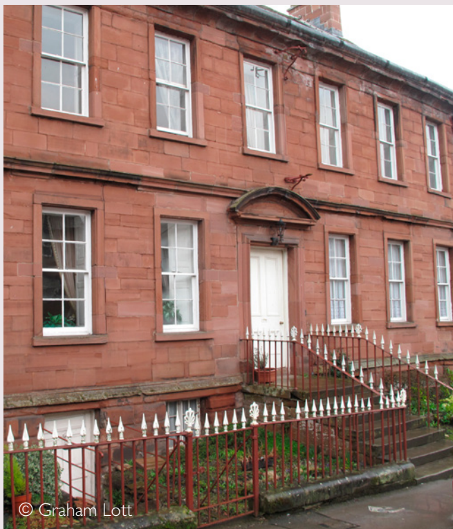
'The Red House' (number 30, Boroughgate) in Appleby-in-Westmorland dates to 1717. It boasts a fine display of brick red Penrith Sandstone ashlar.

Penrith Sandstone features prominently in towns, villages and isolated (farm)houses located on or close to its outcrop. It has been used for many of the substantial buildings in Penrith itself, including the Castle. Appleby-in-Westmorland, meanwhile, boasts a fine display of both dark red (i.e. Penrith Sandstone) and pinkish buff (Carboniferous 'Califerous Sandstone') sandstone fabrics along its largely C17–C19 main street (Boroughgate). There are numerous examples of older villages that are constructed almost entirely of locally quarried red Permian sandstone, including Renwick, Melmerby and Kirkoswald. At Great Salkeld, a thinly bedded horizon occurring within the surrounding Penrith Sandstone has been widely used as a roofing material. The large, thick and heavy sandstone slabs produced are seen on the roofs of cottages, the Church of St. Cuthbert and nearby farm buildings, and are quite unique to the area.