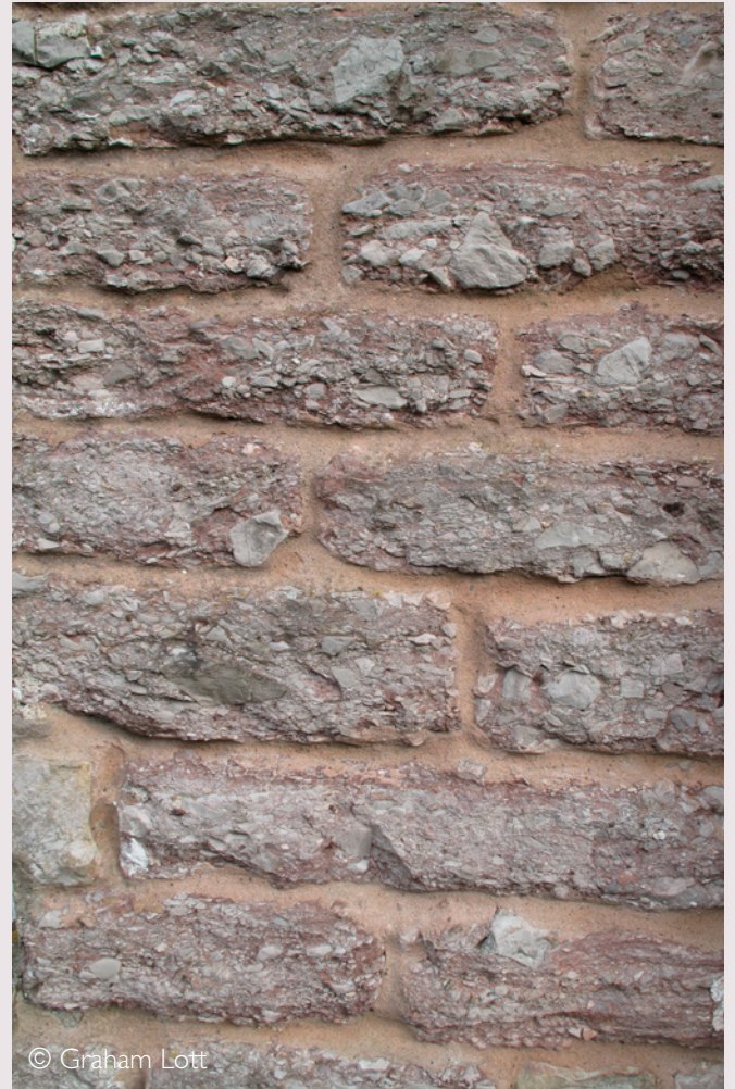
The highly distinctive ‘Brockram’ breccia, blocks of which are seen here in close-up, has been used to construct many of the buildings in the centre of Kirkby Stephen.

dolerite, quartzite and Carboniferous limestone (i.e. they reflect the pre-Permian rocks of the Vale of Eden area, and thereby indicate a local provenance), while the rock matrix can be mud-rich, silty and/or sandy. Examples of the use of Brockram Breccia as a walling stone are provided by a number of the buildings in the centre of Kirkby Stephen.