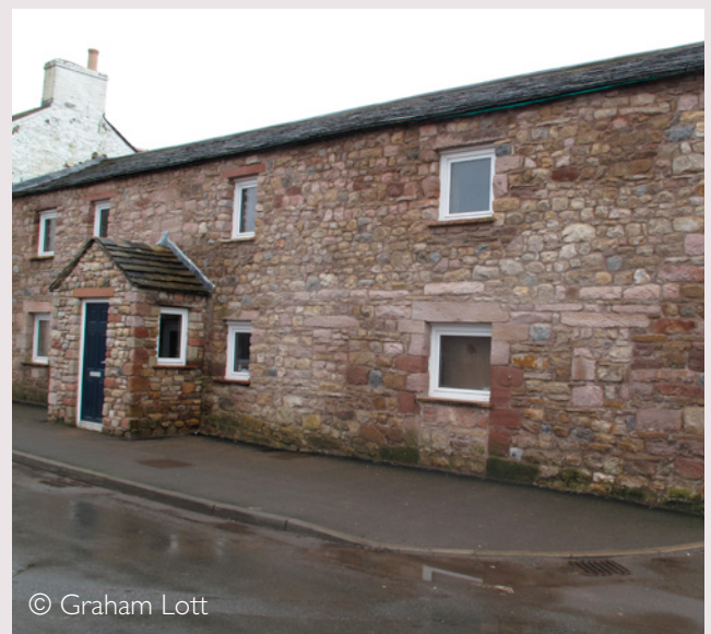
Removal of the render from this recently renovated building in Brough has exposed its wall fabric, which is seen to comprise locally gathered 'fieldstones' and/or stream boulders. As in the villages located along the Solway Firth, the clasts have been used 'raw' or with minimal dressing.