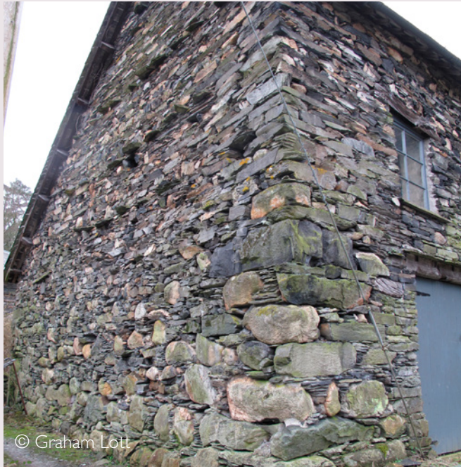
Farm buildings constructed of slate rubble and crudely dressed 'fieldstones' are commonly encountered within the highland 'core' of the Lake District. This particular example has conspicuously large quoins comprising squared boulders of various lithological types.

Oxen Fell and Loweswater. Other non-agricultural buildings of this type include Coniston (Old) Hall and Hawkshead Courthouse. In some cases, the windows and doors of such buildings are framed with better quality, sawn slabs of Lower Palaeozoic 'slate' lithologies, Carboniferous sandstones and limestones, and red Permo-Triassic sandstones.