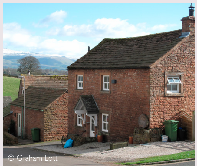
The same thinly bedded slabs of Penrith Sandstone that have been used to roof the Church of St. Cuthbert in Great Salkeld are seen on dwelling houses and farm buildings throughout the village.