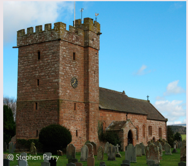
The Norman Church of St. Cuthbert in Great Salkeld, with its imposing tower (a Peel tower added in the C14), has a stone flag roof comprising thinly bedded slabs of Penrith Sandstone.