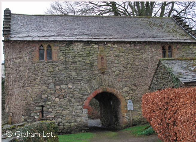
Angular rubblestone and boulders, principally of Borrowdale Volcanic Group lithologies, dominate the walling fabric of Hawkshead Old Hall. 'Imported' Permo-Triassic sandstone has been used for the window mouldings and other decorative work.