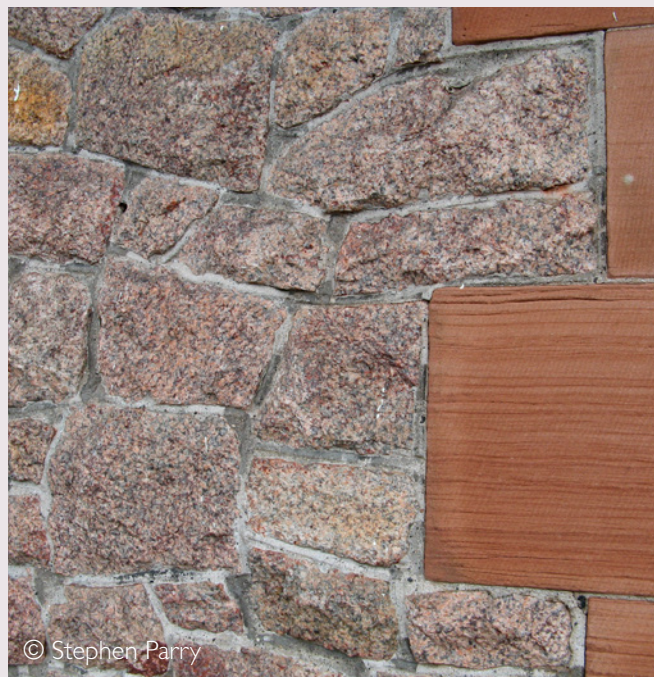
Millom railway station, opened in 1850 by the Whitehaven & Furness Junction Railway, is constructed of angular blocks of 'Eskdale Granite' with dressings and bands of red-brown Sherwood Sandstone.

The grey 'Broad Oak Granodiorite' has been both quarried and gathered (in the form of 'fieldstones') around Waberthwaite for use as a building stone and, occasionally, as an ornamental stone. The large quarry to the west of Broad Oak itself is