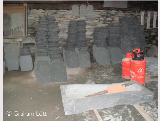
Production of olive green coloured roofing slates continues today by traditional means at the Honister Slate Mine. The slates are worked from the Eagle Crag Sandstone Formation of the Borrowdale Volcanic Group.

The cleaved lithologies in general have been employed for vernacular building purposes, both as a roofing and as a walling