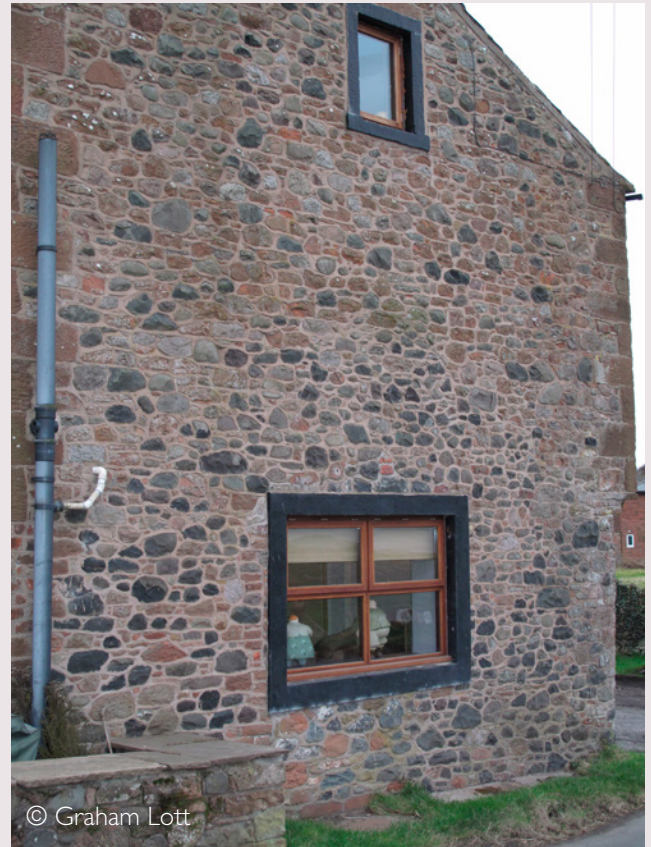
Rounded boulders and cobbles, used 'raw' or with minimal dressing, are commonly seen within the small settlements overlooking the Solway Firth. This cottage in Port Carlisle serves as a good example, and highlights the lithological variability of the clasts.

A far more common practice in the rugged highland 'core' of the Lake District, however, was to use angular rubblestone gathered and/or 'quarried' from surface outcrops. There are numerous farm buildings (dating to the C17 and C18) constructed of 'slate' rubble, which often have conspicuously large 'slate' quoins and lintels. Many of these buildings also have roofs of local 'slates' (generally laid in diminishing courses). Specific examples include farm buildings at Troutbeck [NY 40 03], Boon Crag (near Coniston), High