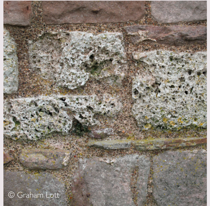
The keep of Brough Castle locally features blocks of white, highly porous calcareous tufa, presumably worked from local deposits.

Isolated blocks of white, highly porous, calcareous TUFAs appear sporadically in some wall fabrics (e.g. Brough Castle), but this particular building stone is not commonly encountered across Cumbria, suggesting that it was never available in any great quantities.