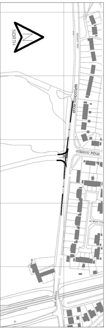
LOCATION PLAN (1:2000)

REFERENCE DRAWINGS 869/AR/002 – RLF Proposed Plan