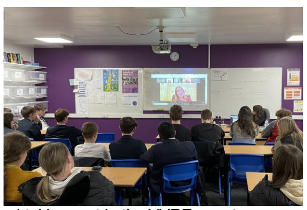
Pupils from William Howard School taking part in the VVRE event.

An example of a write up of the project is on the William Howard School website <a href="https://example.com/here">here</a>. The VVRE project was also written up as a case study in the Inter Faith Week 2022 report (see page 37 <a href="https://example.com/levels.org">IFW Report 2022 (interfaithweek.org)</a>. The project has been showcased at more events including the Devon and Torbay SACRE conference, ARIEAC conference, and the Humanist UKs national CPD training event.