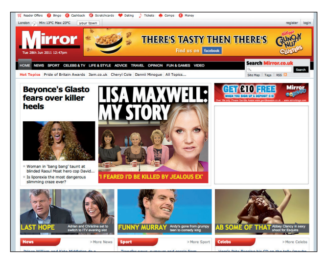
Daily Mirror web page