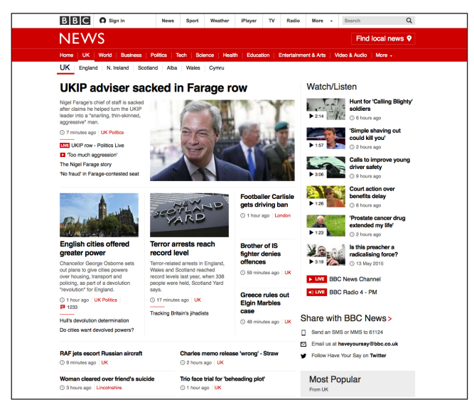
BBC News web page