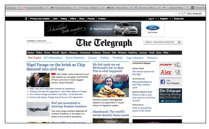
Daily Telegraph web page