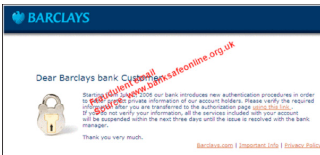
Example phishing email