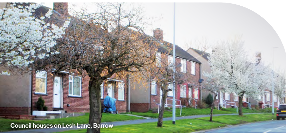
Council houses on Lesh Lane, Barrow

We are now working towards the silver accreditation, which requires 15% of the workforce to be certified as carbon literate, along with meeting other requirements.