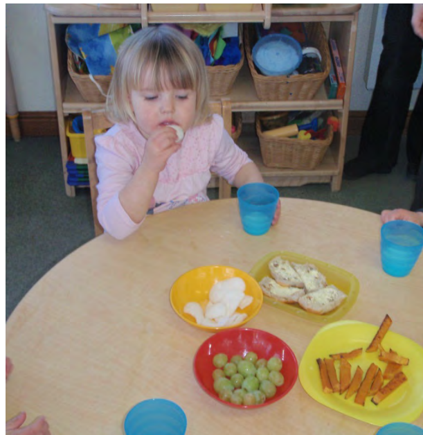
Children at ACC enjoying a healthy snack

As a result of the Nutrition Training practitioners sent letters to parents encouraging them to help children become healthier and beat obesity within their communities. An example is this letter sent out by Aspatia Community Childcare