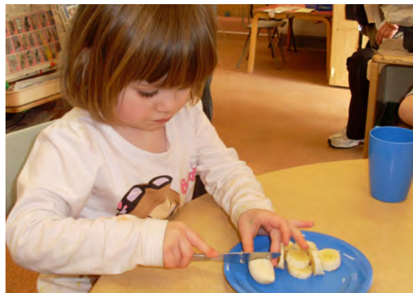
Chopping bananas at snack (child age 28 months, excellent fine manipulative skills as a result of regular opportunities to engage in cutting and spreading).