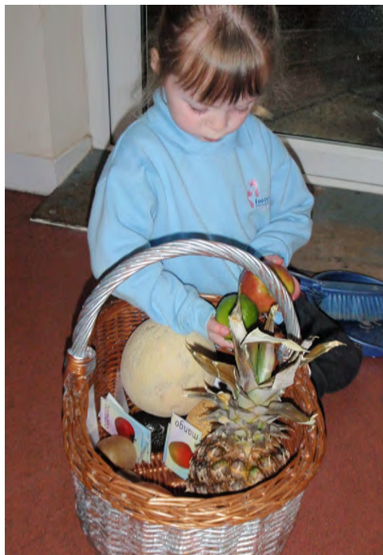
Exploring the fruits in Handa's Surprise