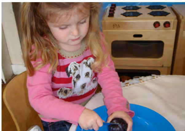
Fruits from the Very Hungry Caterpillar