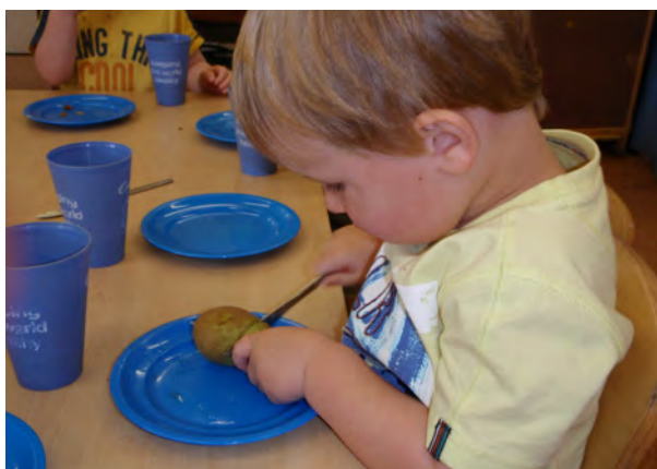
Pears for snack

As a result of the training Footsteps Nursery came away considering portion sizes which was one of the main considerations when planning the training. They also debated the appropriate ages for blue and green top milk, noting the quantities each child may be drinking prior to lunch and re-visited the Caroline Walker Trust checking guidelines against current practice. They would like to further the knowledge gained on the training by attending HENRY core training.