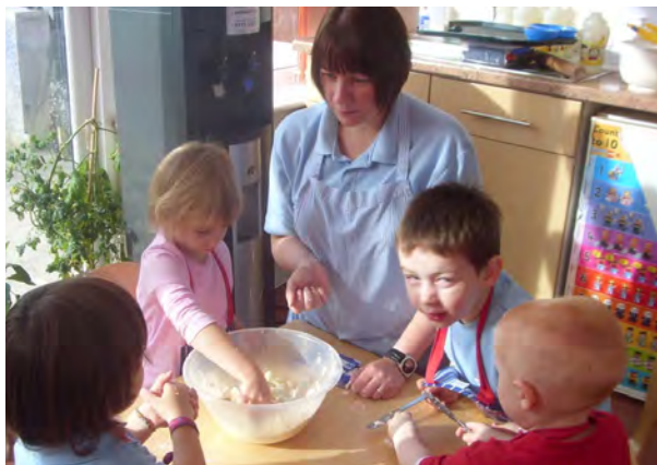
Blackberry pie for lunch