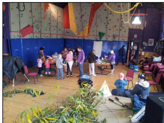
Lantern making in the main hall.

Euphoric Circus and Appleby celebrated its 11 th year of the annual fire and light show. The event attracted over 430 people from the local community. The event started at 6pm with a lantern parade of 250 children and families, all displaying a wide range of willow and paper designed lanterns, the fire show included fire eaters, fire juggling and fire sculptures, it was fair to say the show was a fantastic spectacle enjoyed by all.